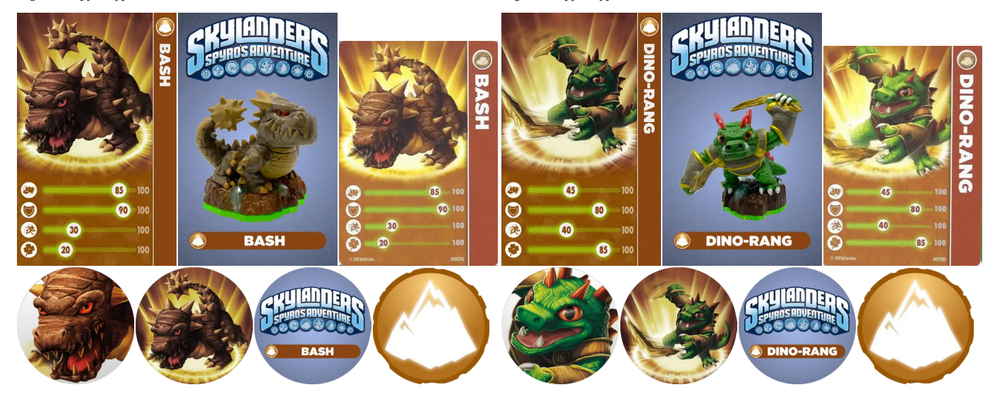
7, game = spyro, type = earth, name = LEGENDARY BASH, role = \,