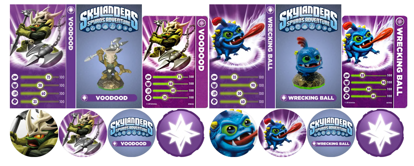
36, game = spyro, type = magic, name = WRECKING BALL, role =