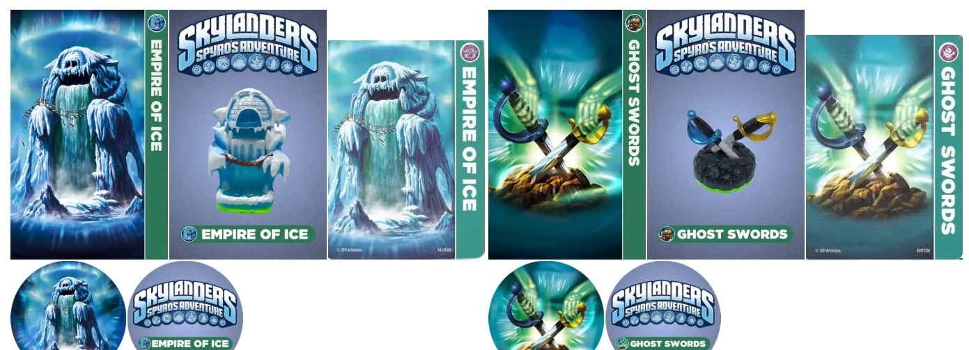
18, game = spyro, type = item, name = GHOST SWORDS, role =