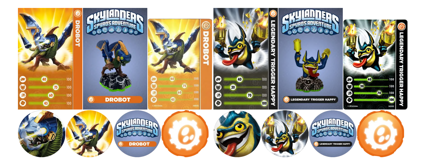
45, game = spyro, type = tech, name = TRIGGER HAPPY, role =