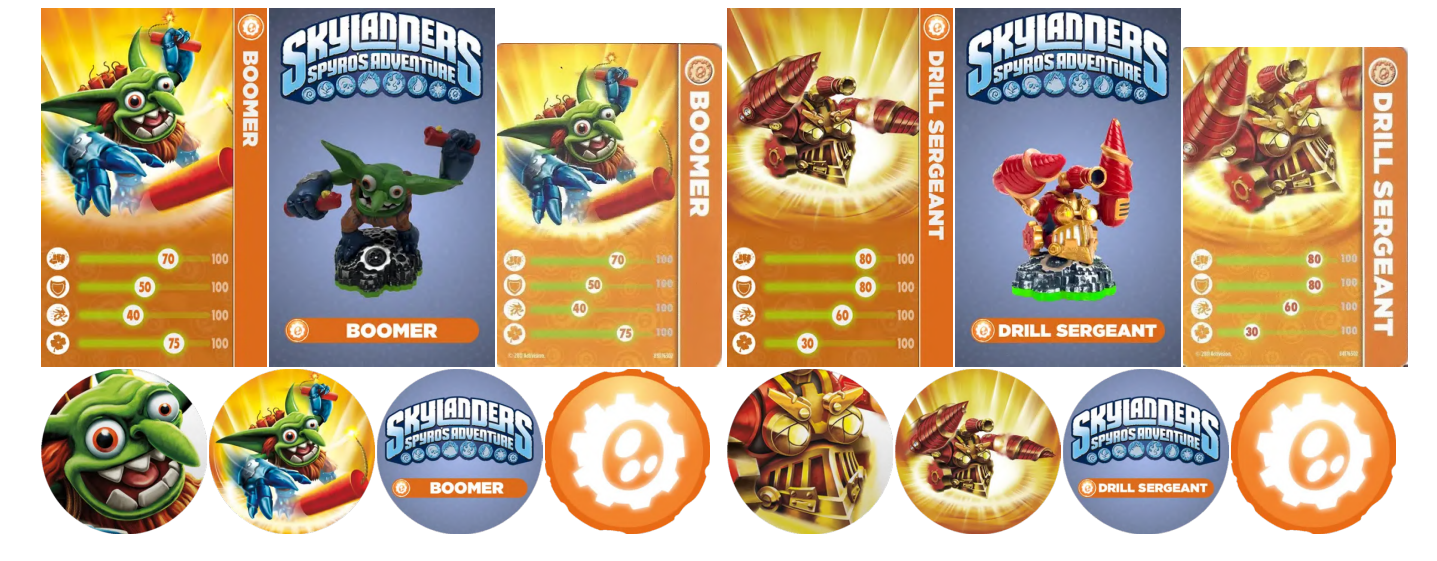
42, game = spyro, type = tech, name = DRILL SERGEANT, role =