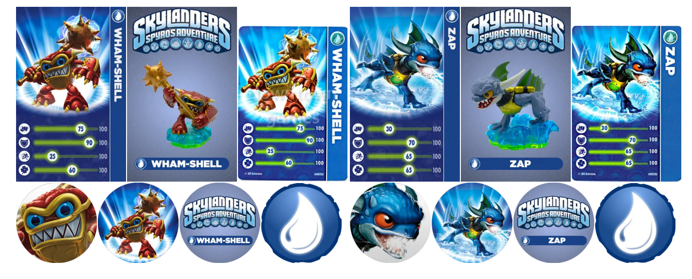
54, game = spyro, type = water, name = ZAP, role =